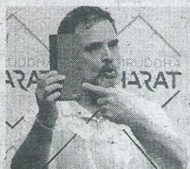
पंचकुला में एक सम्मेलन में बोलते कांग्रेस नेता राहुल गांधी।

राहुल गांधी ने की मांग को के भारत में 90 दलित, आदिवासी और